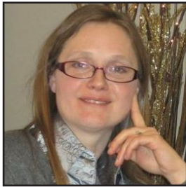
Agata Czajkowski Violin